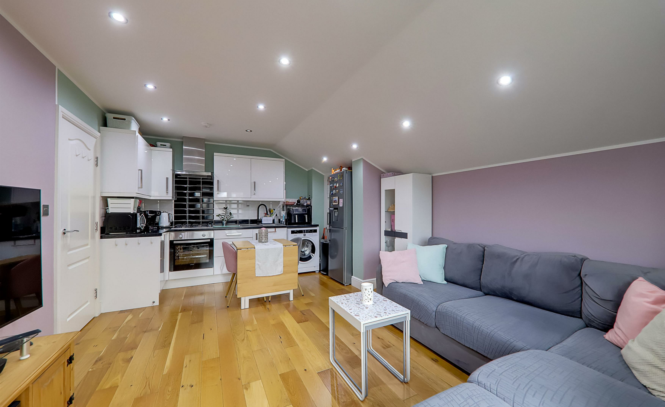
Flat 1, 23a Chapel Road, Worthing, BN11 1EG Guide Price £170,000